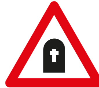
Thoughts of death or suicide