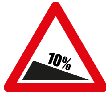
Decreased energy and feeling slowed up