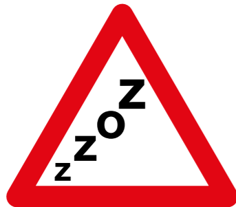
Sleep changes. Difficulty sleeping or sleeping too much