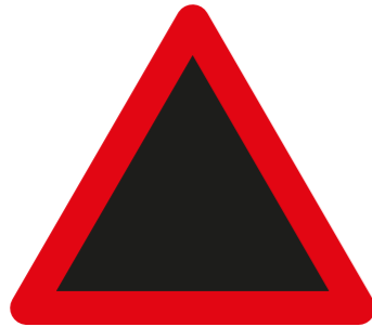
Feelings of hopelessness and pessimism