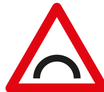
Persistent sad, anxious or empty mood