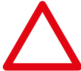
Feelings of worthlessness, guilt and helplessness