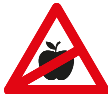
Significant change in appetite or weight