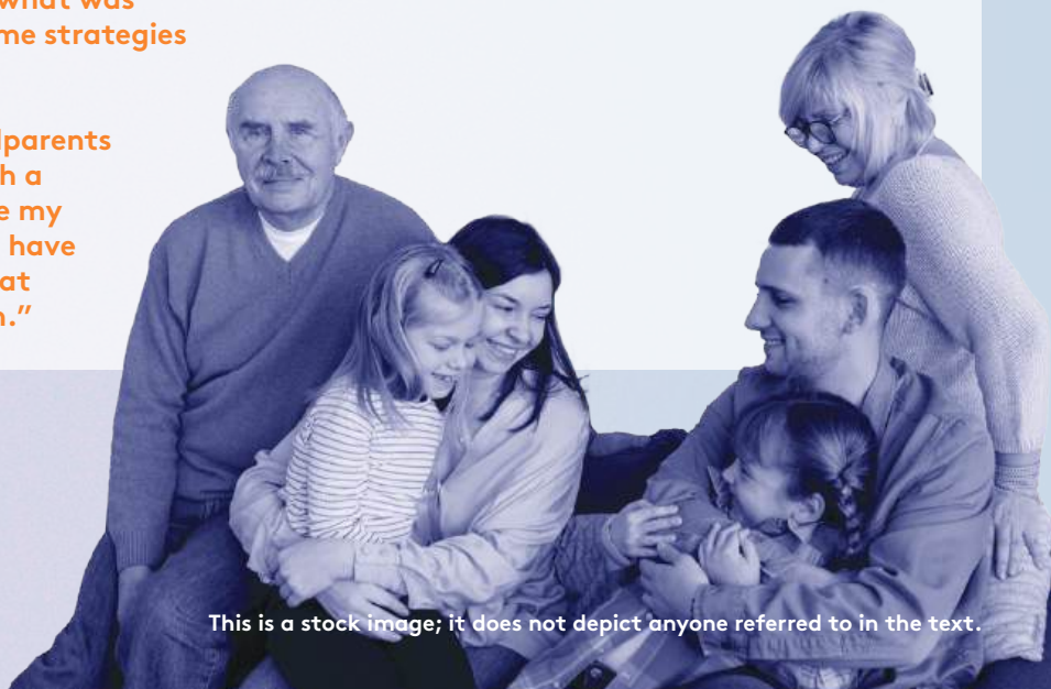
This is a stock image; it does not depict anyone referred to in the text.

Molly's story illustrates the crucial role of adults in young people's mental health. Parents, carers, teachers, aunts, uncles, friends – we can all play our part. We hope this Impact Review shows how.